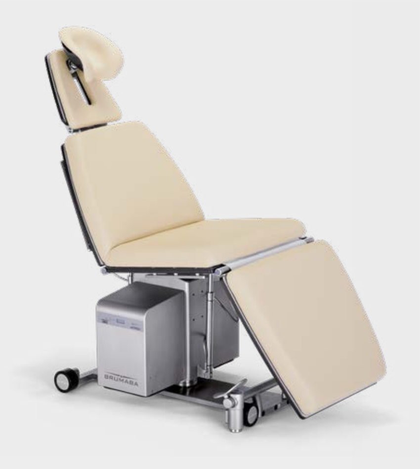
Operating table GENIUS

Experience our leading edge in ergonomics, comfort, reliability, and efficiency for yourself. BRUMABA - your ideal partner for a healthy future!