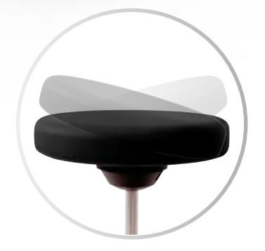
Available with COMFORT SWING seat cushion