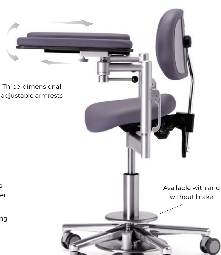
Height adjustment by foot release