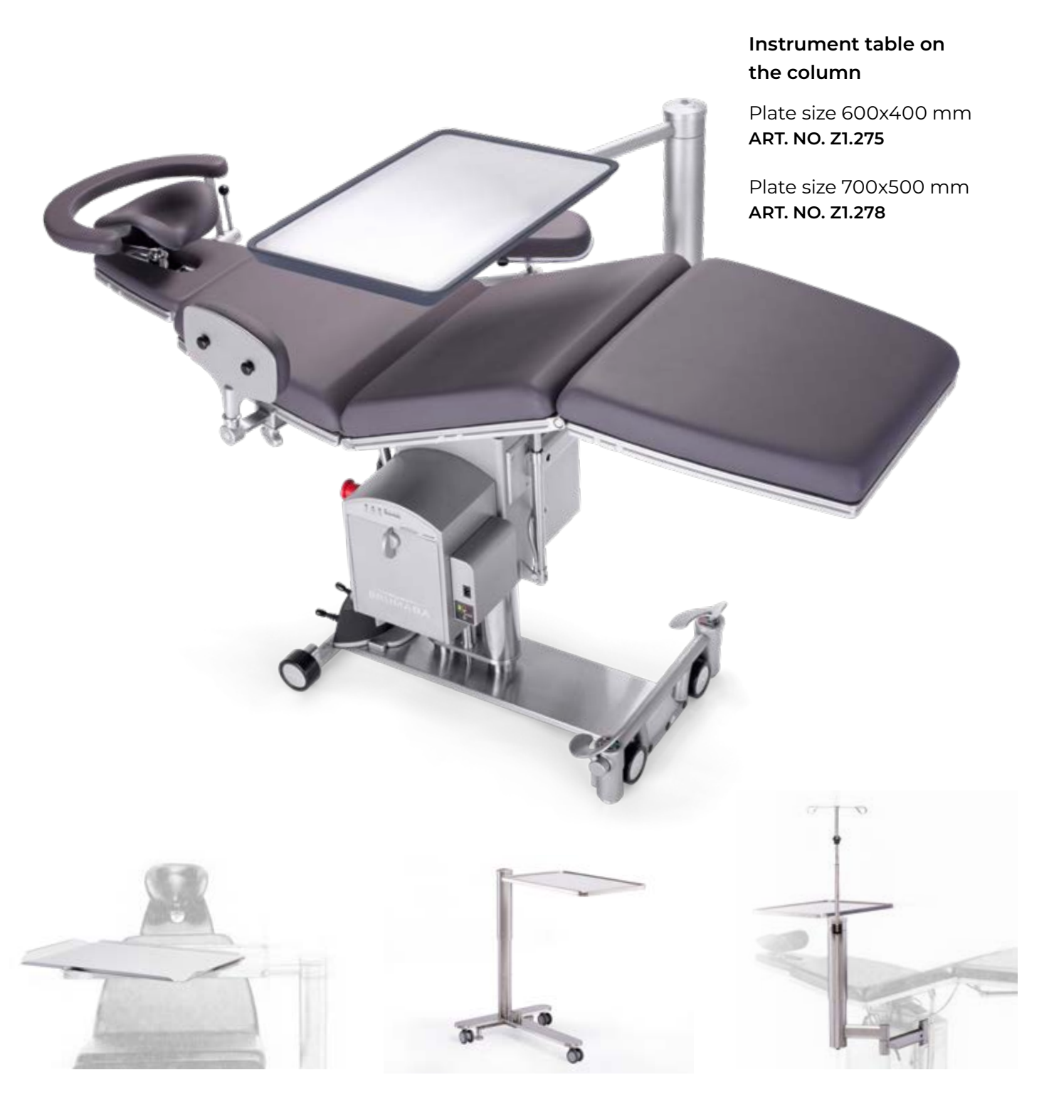
Aluminium shelf for instrument table

BRUMABA add-ons for even more function and comfort