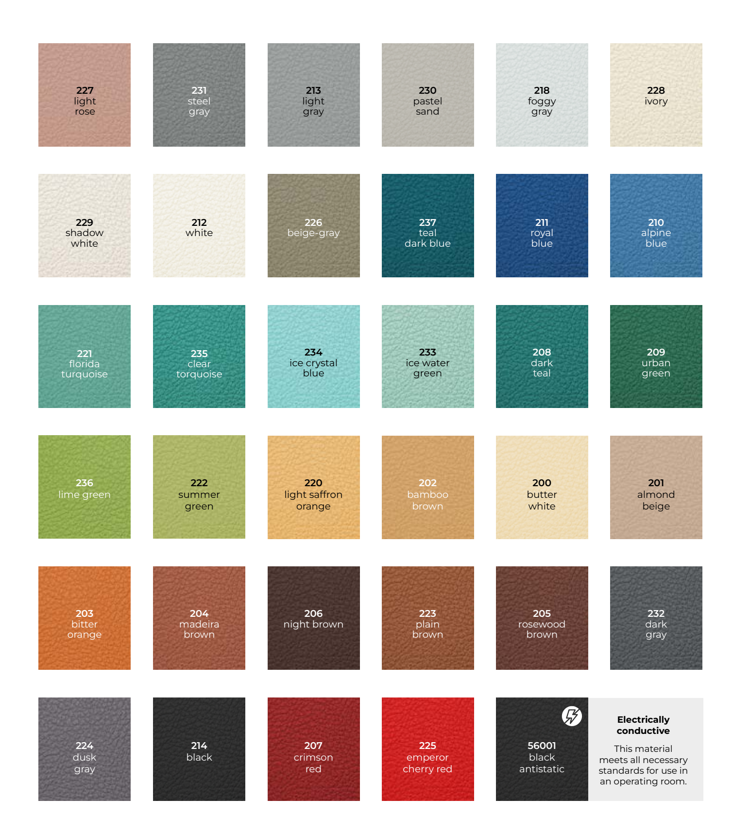
Color swatches may differ from the original color tone.

Our cushion colors are available for both operating tables and stools/chairs, allowing for seamless integration of your BRUMABA products into your operating room environment.