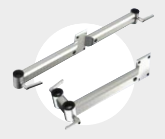
Mounting arm on both sides ART. NO. M.000703

Double mounting arm left ART. NO. M.000843