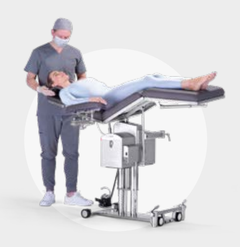
Operating while standing