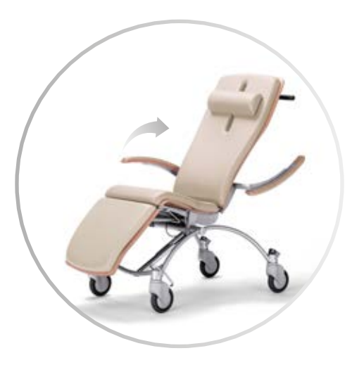
Armrests automatically adjusted to reclining position (foldable)