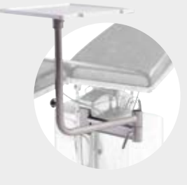
Tray for motor, small 400 x 360 mm